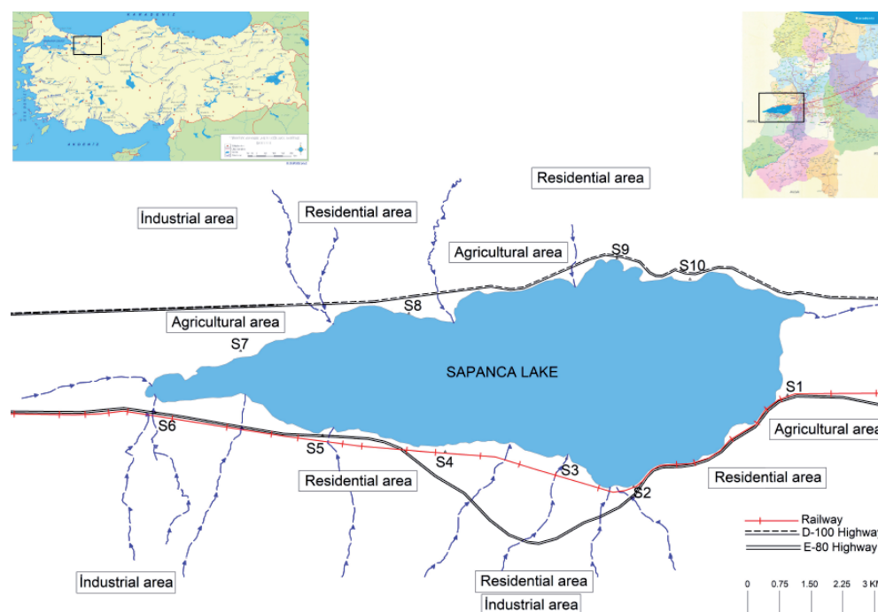
Fig. 1. Map of soil samples in Sapanca Lake basin.

in a tectonic pit. It extends parallel to Iznik Lake and reaches up to Adapazari Plain as a continuation of Izmit Bay (Fig. 1). It is known that underground waters also feed the lake. Fruit, vegetable and cereal production are important agricultural activities to the south and southwest of the lake. The use of pesticides and chemical fertilizers is widespread in the region in order to protect agricultural products against disease and harm, and to increase productivity. Sapanca Lake is used both as a drinking water source and as process water for factories and facilities. The D-100 highway is located in the north of the lake, TEM Anatolian Highway and railway are located in the south. As a result of this heavy traffic, there are gas stations on the coast of the lake [27].