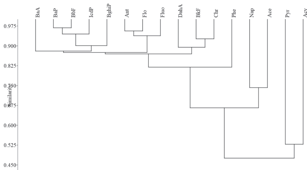
Fig. 3. Results of cluster analysis for PAHs components.

BkF, Chr, DahA, Flo, Fluo, IcdP and Phe) and factor PC2 represents the petrogenic origin (Acy, Nap and Pyr).