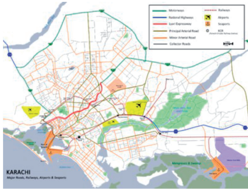
Fig. 1. Location of towns in Karachi.