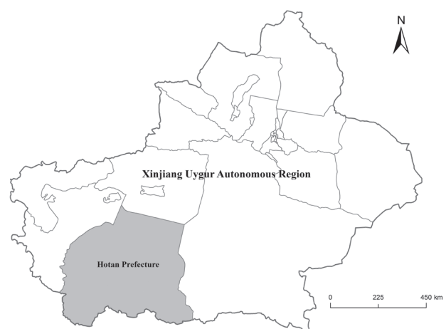
Fig. 1. Location of Hotan Prefecture.

Hotan Prefecture is located in the southernmost tip of Xinjiang Uygur Autonomous Region. It covers an area of approximately 248,100 \text{km}^2 , with mountains accounting for 33.3%, deserts 63%, and oases 3.7%. The oases are divided into more than 300 subsections by desert and The Gobi. Its economy is dominated by agriculture [2, 23]. Hotan prefecture has many windbreaks. To make full use of local resources, expand the economic benefits of agriculture, and increase the income of the farmers, Hotan has developed its characteristic forestry and fruit industry for more than 15 years. The woodland area was 13.47 \times 10^4