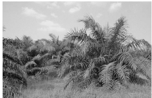
Fig. 2. Oil palm plantation at UPM.

Furthermore, total nitrogen content in plantations were less than those in the secondary forest soil. However, this was inconsistent with the results demonstrated by [58-59], whose study found no significant differences between forest and plantations for TON. As our findings concurred with the results of the study by [42, 60], these authors averred the possible reason to the continuous fertilizer application that resulted in decreases in soil nutrient levels and cycling, e.g., nitrogen. Other possible reasons can be linked to the agricultural practices such as initial land clearance, water table management, and liming [58]. Moreover, pH increase under plantation might have increased the organic matter decomposition in soils,