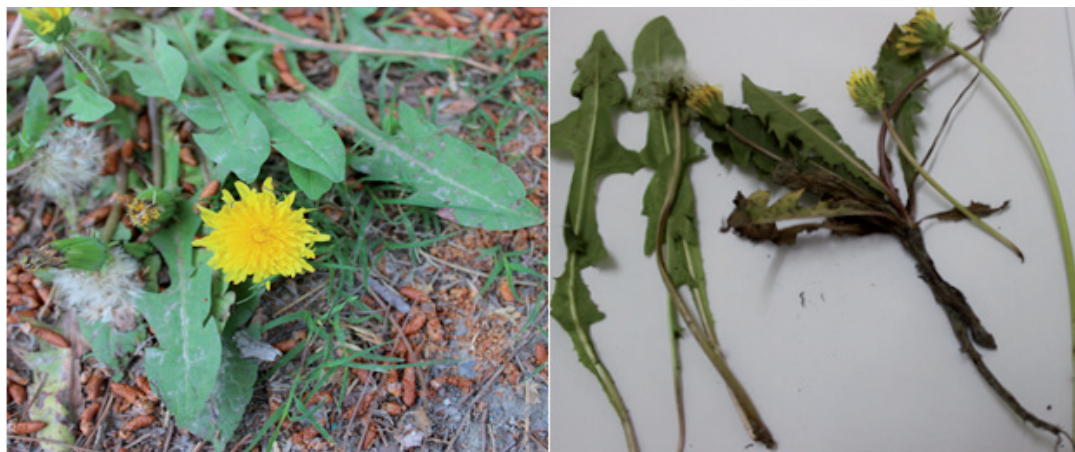
Fig. 1. Taraxacum officinale showing habitat and roots.

produces stems that are typically 5-40 cm tall, though in some cases it may grow up to 70 cm high. The foliage may be upright-growing or horizontally spreading. The plant is characterized by hairy stems, milky latex, and basal leaves (Fig. 1) with one single flower head. The flower heads are ligulate and bisexual. The leaves are obovate in shape with strident or gentle teeth [10].