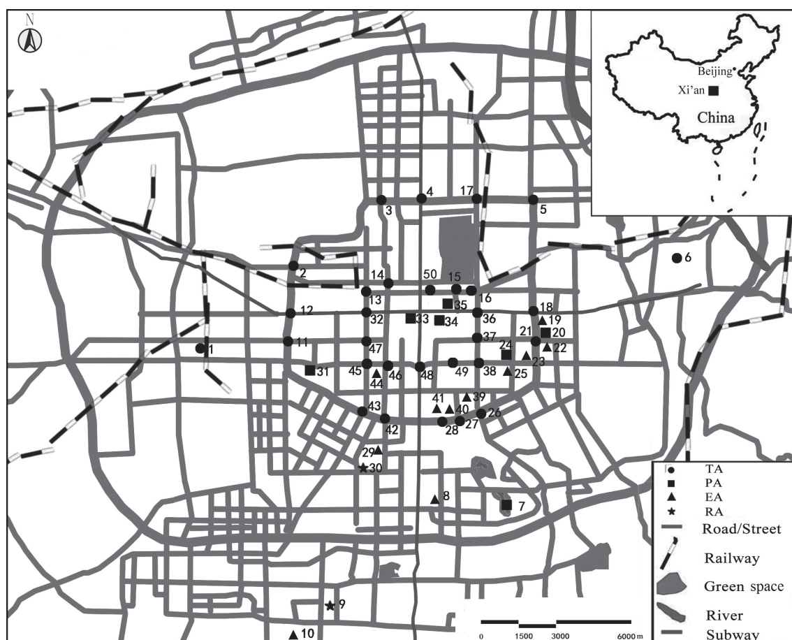
Fig. 1. Study area and sampling locations from 4 various functional areas in Xi'an.

Xi'an, a famous historical and cultural city, is located in the Guanzhong Basin of Shaanxi Province in northwest China (Fig. 1). Its climate is a temperate continental monsoon climate. The annual average precipitation and temperature of Xi'an are 500-700 mm and 13-15°C [1]. The permanent resident population was more than 8.7 million in 2015. The motor vehicle number was 2,394,100 in 2015. Static wind weather occurs frequently in Xi'an owing to the city being surrounded by mountains, and this may prevent dust from migrating and may influence the local environment [17]. Being the capital city of Shaanxi province, Xi'an is also a center of education, culture,