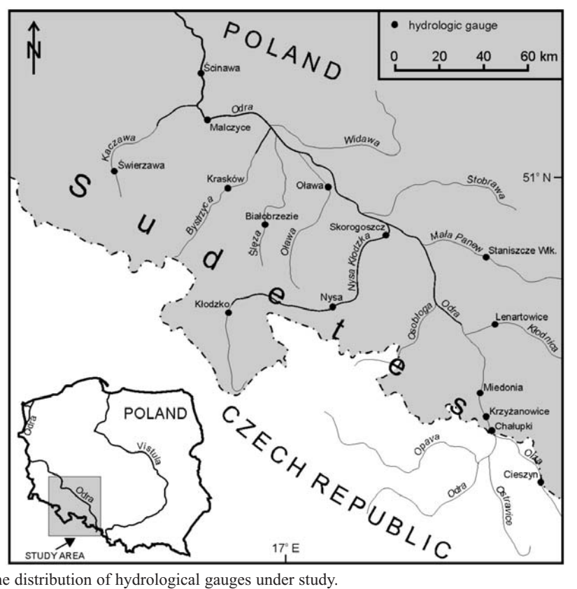
Fig. 1. Study area and the distribution of hydrological gauges under study.

We have examined 15 sites located along the Odra River basin in SW Poland (Table 1, Fig. 1). Most of them are located within the Nizina Slaska Lowland, but there are also a few sites located in the hilly areas of the Fore-Sudetic Block, the Sudetes and the Carpathian Mountains.