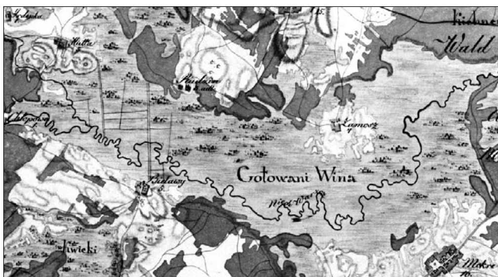
Fig. 2. Middle part of the Niechwaszcz Valley on Schrötter's map from the end of the 18 th century [7].

The changes show spatial regularities and strong dependence from the main types of morphological units (Fig. 1C and Table 2).