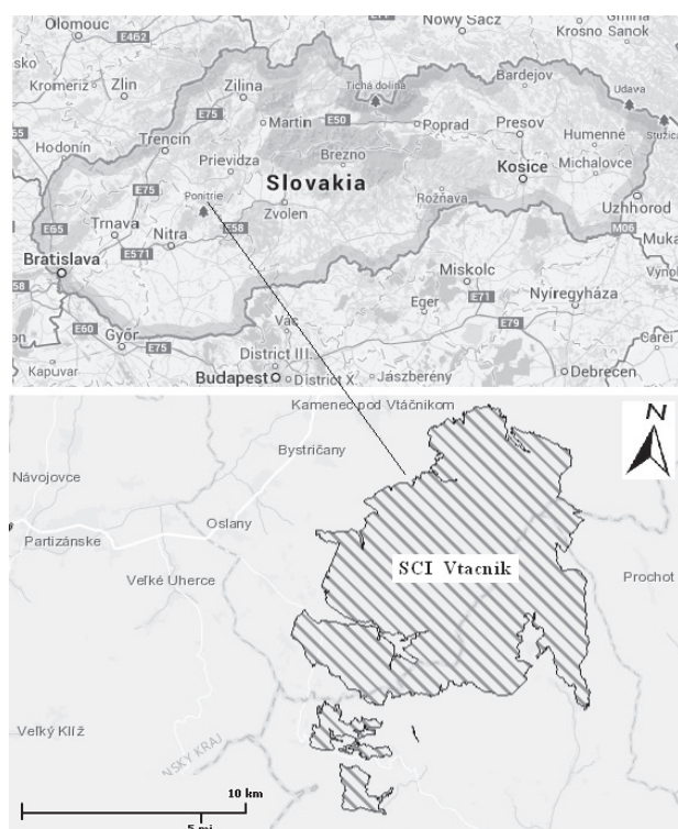
Fig. 1. Map of recreational sites in the evaluated area.

According to a comparison of our research with the results of others assessing protected areas in Slovakia, where the recreational values were also evaluated by travel costs methodology and willingness to pay for specific services (WTP), there aren't bigger differences in demographic and socio-economic structure and characteristics of visitors. The average