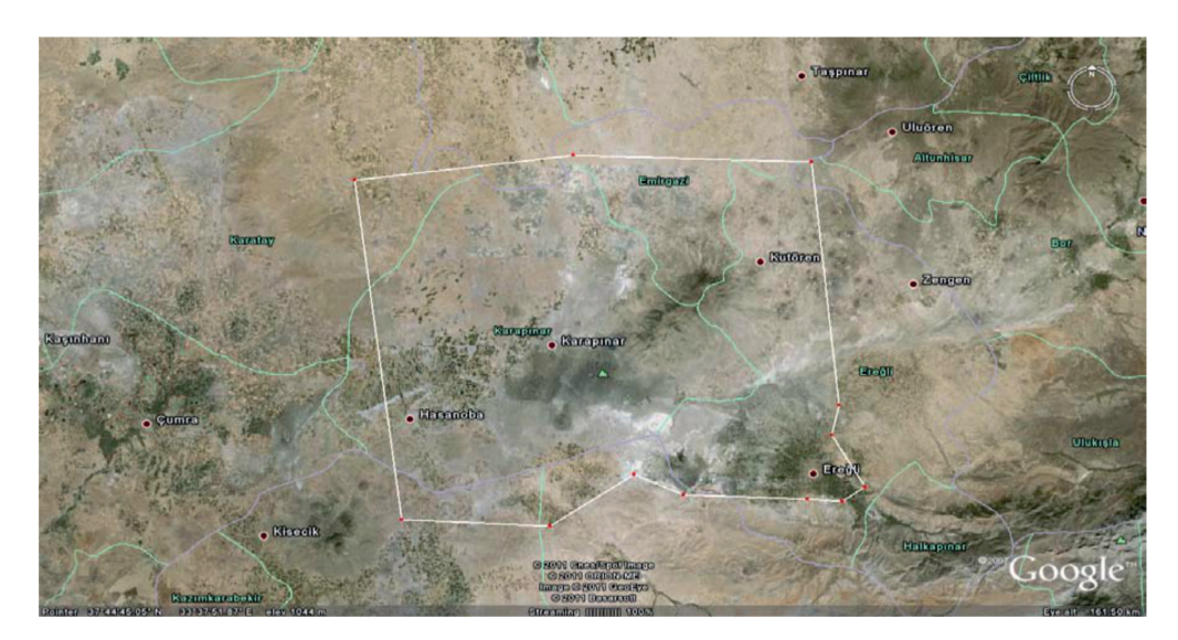
Fig. 1. Project area location map.

The majority of the study area is located within the Karapınar District borders. The region is dominated by continental climate that is warm and dry during summer and cold and rainy in winter. Average precipitation in Karapınar is 283.9 mm/year, which is far below the national average of 643 mm/year. Free water surface evaporation is around 2000 mm in the region [9]. The highest level of precipitation in the area is seen in spring (40%), followed by winter (38%), fall (15%) and summer (8%). Low precipitation during the summer months is accompanied by severe levels of evaporation.