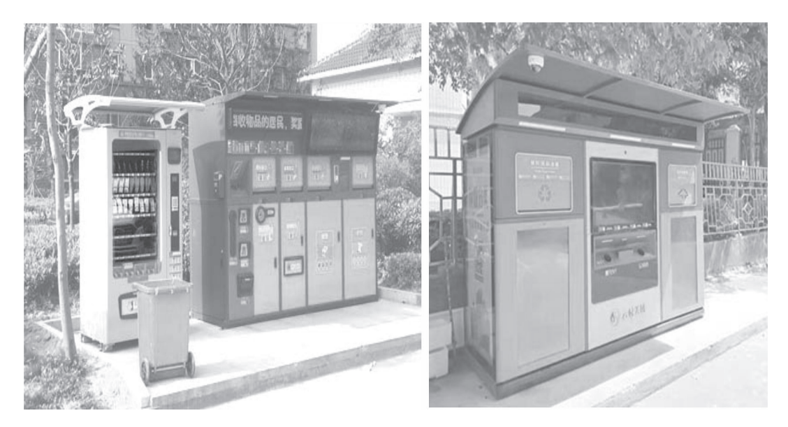
Fig. 2. Smart waste bins in residential areas.

Perceived sacrifice refers to individuals' perceived giving-up when he performs a certain behavior. When