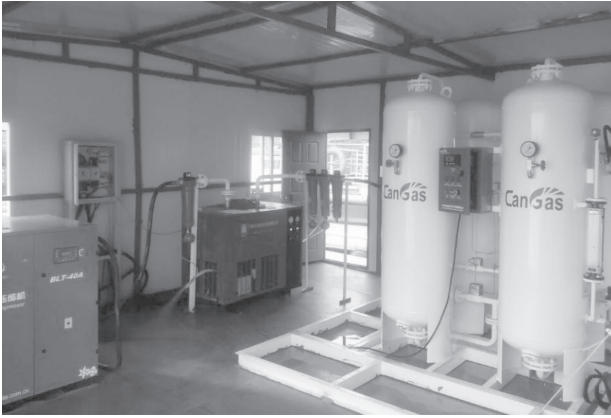
Fig. 2. Photo of the reoxygenation system on the platform.

The intrusion process occurred at a water depth range from 10-14 m. The accuracy of the monitoring equipment of the intrusion flow for depth and dissolved oxygen was up to 0.001 and 0.01, respectively. In this study, nine complete monitoring results of the intrusion flow were counted (Fig. 3). Within a radius of 150 m, the presence of the intrusion flow was detected nearly every time at a water depth range from 11-12 m, indicating that the intrusion flow was more frequently found at the relative upper side of the intrusion layer (10-14 m). However, the intrusion thickness decreased with an increase in the intrusion distance. At the end of the intrusion (250-300 m), the intrusion thickness was less than 2 m. During the nine monitoring processes, the presence of the intrusion flow could only be detected 1-2 times at the end of the intrusion distance. The spread of the axisymmetric intrusive gravity currents at the equilibrium depth reached a 250 m radius horizontally from the in situ water column. In spite of repeated attempts to monitor the