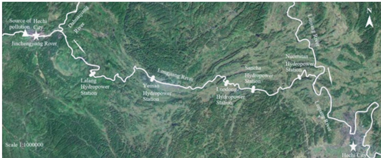
Fig. 3. The location map of cadmium pollution accident.

Hydropower Station in Longjiang River reached 0.408 mg/L, which was 81.6 times higher than standard limit of Class III water body in the Environmental Quality Standard for Surface Water. The length of the pollution group was 25 km, and the downstream was the Liujiang River section of Liuzhou drinking water source protection [21]. The relevant location of cadmium pollution accident is shown in Fig. 3.