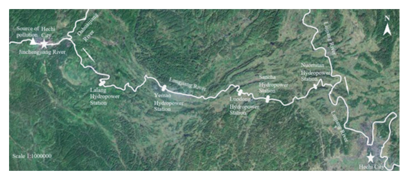
Fig. 3. The location map of cadmium pollution accident.

Hydropower Station in Longjiang River reached 0.408 mg/L, which was 81.6 times higher than standard limit of Class III water body in the Environmental Quality Standard for Surface Water. The length of the pollution group was 25 km, and the downstream was the Liujiang River section of Liuzhou drinking water source protection [21]. The relevant location of cadmium pollution accident is shown in Fig. 3.