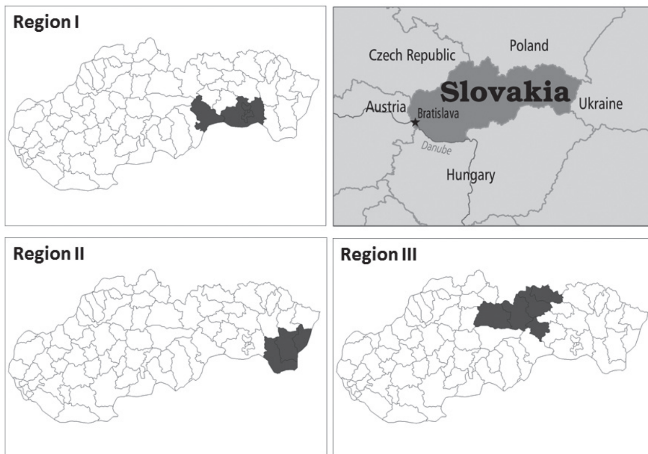
Fig. 1. Sampling areas of examined raptors species. Region I (Abov and Gemer); Region II (Dolný Zemplín); Region III (Spiš and Tatry).

Tatry and Spiš are mainly tourist regions with three national parks situated on their territories.