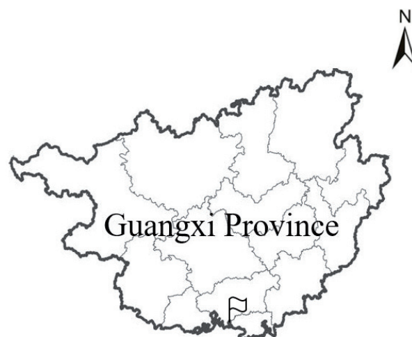
Fig. 1. Location of the sampling areas (white flag).

Sample sites were cleaned of objects and detritus before sediment samples of soil layers (0~20 cm) and (20~60 cm) were excavated via polyvinyl chloride tubes with a diameter of 6.0 cm [26]. Five soil