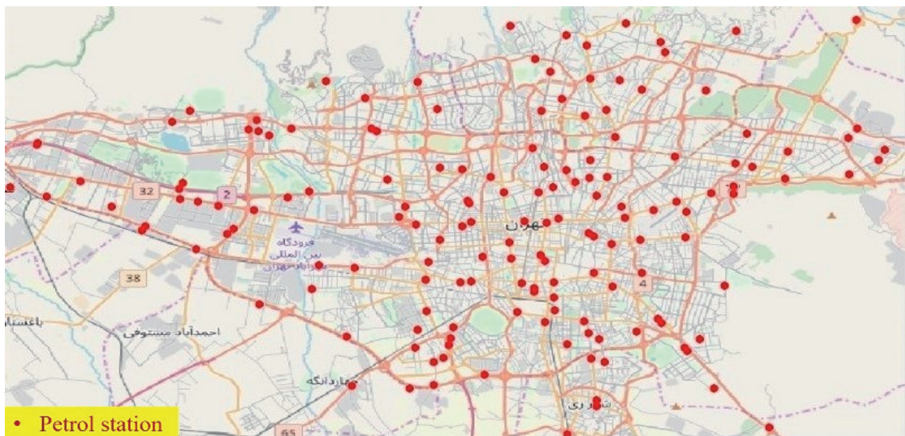
Fig. 1. The place of 148 petrol pumps in Tehran.

A total of 148 petrol pumps in Tehran city (Fig. 1) were studied.