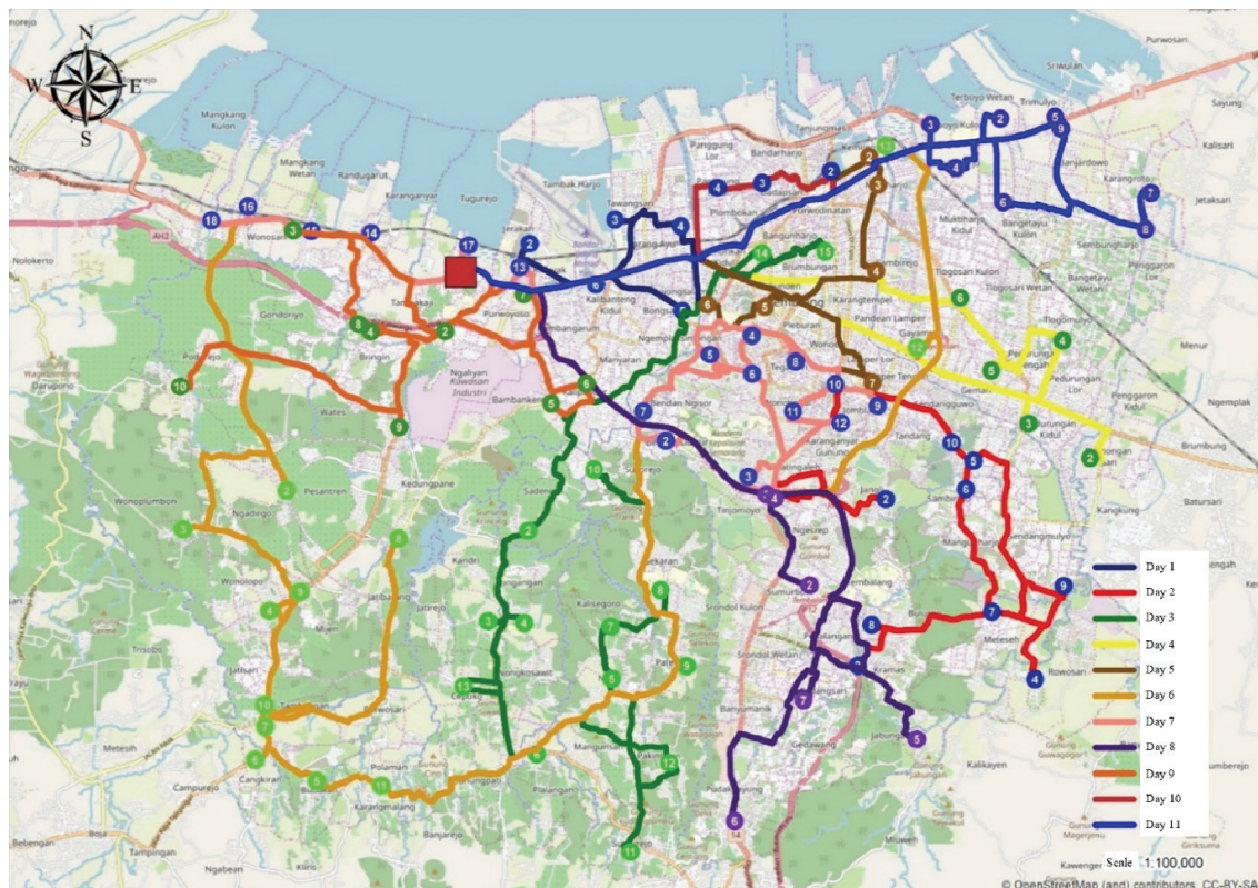
Fig. 2. Collection route in scenario 1.

Even though scenario 2 requires an additional trip, it does not require other workers and vehicles because the difference is insignificant. The comparison between scenarios 1 and 2 can be seen in Table 3. This study recommends scenario 2 with the advantage of a shorter range and fewer land requirements. The need for narrow land is essential because, if the land required is too