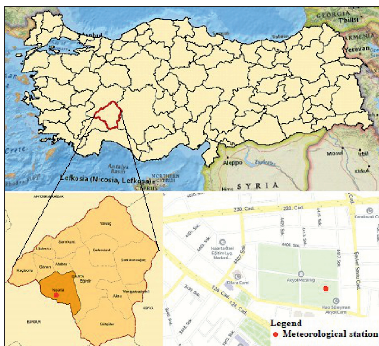
Fig. 1. The location of Isparta Province in Turkey and the meteorology station is located in the Akyol Cemetery.

Within the scope of the study, first, the region where the station was located was selected to determine the urban area's climate values. This area was chosen as the Akyol cemetery, which remains in the city but does not have cultural influences.