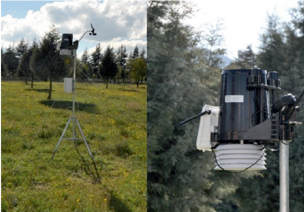
Fig. 2. Portable weather station (Latitude (north) 37°45'15.34"; Longitude (East) 30°34'38.30").

Air temperature, wind speed, solar radiation, and relative humidity data recorded at the station at 10.00, 12.00, 14.00, 16.00, and 18.00 every day until the end of April-October, which are the months people use the outdoors the most, were used. The aim here is to reveal the most suitable time zone for outdoor recreation activities that can be carried out at any time of the day.