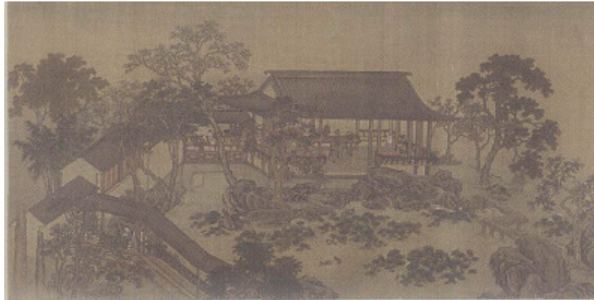
Fig. 4. The fourth section of Xiu Garden