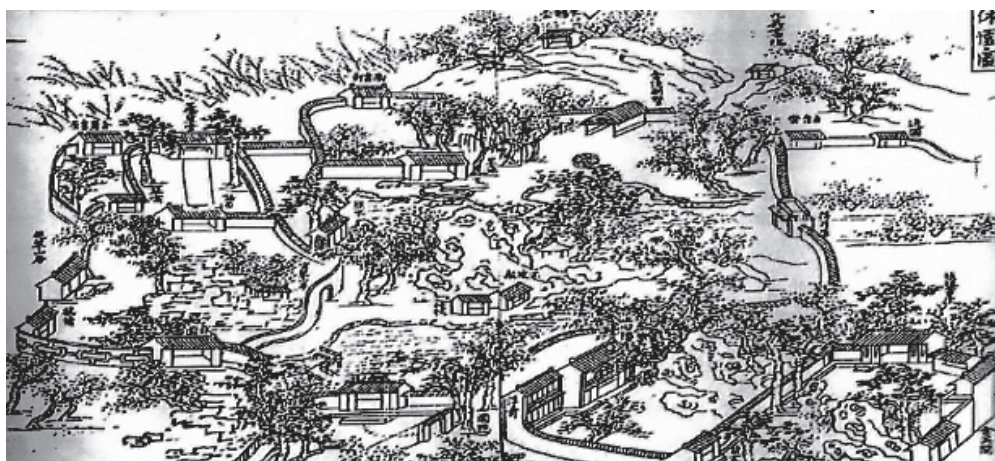
Fig. 1. Perspective view of Xiu Garden.

Through a large number of local Chronicles, literati collection and folk historical materials, mutual research of literary history, to understand the Ming Dynasty Jiangnan merchant garden real situation. While fully reproducing the history, it can explore the unique cultural connotation of the garden. Through the investigation of cultural practice activities in gardens, we can explore the social functions of merchant gardens in the unique social environment of Ming Dynasty, and