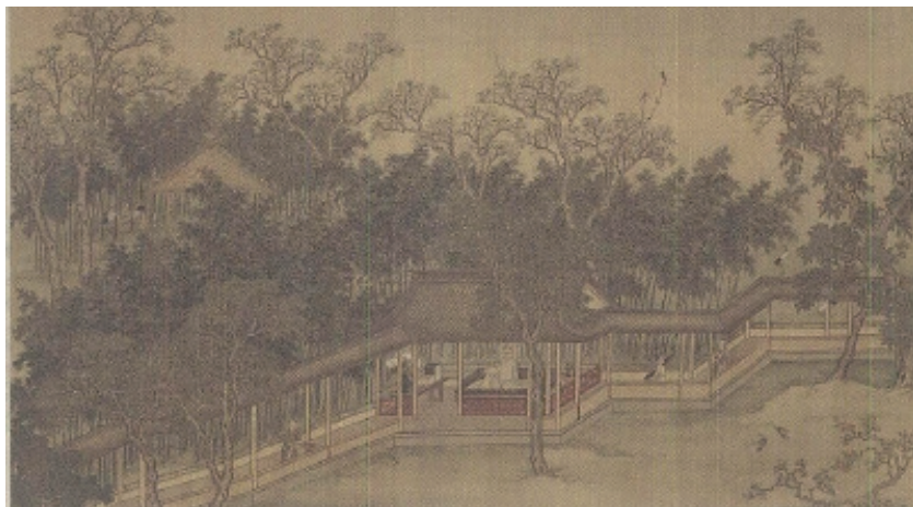
Fig. 5. The fifth section of Xiu Garden Source ditto.

to me that it often snows after the winter solstice, and the garden is covered with snow. At a glance, there is a vast expanse of white, quiet and airy, crows crowing in the wind-swept dead trees, and from time to time, I can hear fretting and wailing in the bamboo forest. The desolate crowing of the silent garden is not a pleasant scene to visit [18]. The second paragraph of Wang Yun's scroll is also described. Through the part of the rocks, the convex parts are mostly blank, and