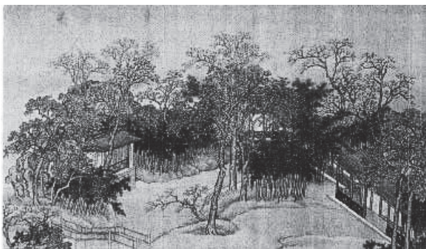
Fig. 6. The tenth section of Xiu Garden

The above description explains that spring, summer and autumn are the best seasons to enjoy the landscape in the garden. It can be inferred that in summer, the high summerhouse is cool and airy on all sides. At dusk, the sunset glow on the distant ridge becomes a useful sight in the garden. In autumn, the golden leaves