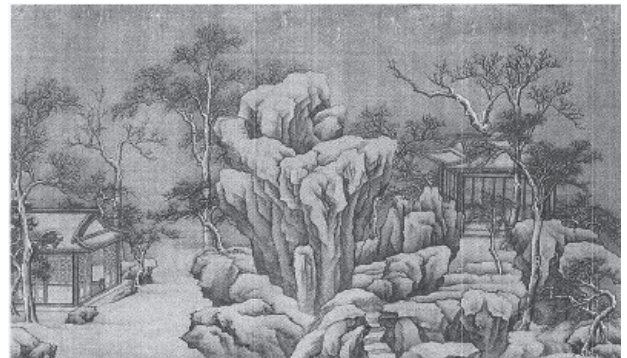
Fig. 7. The second section of Xiu Garden Source ditto.