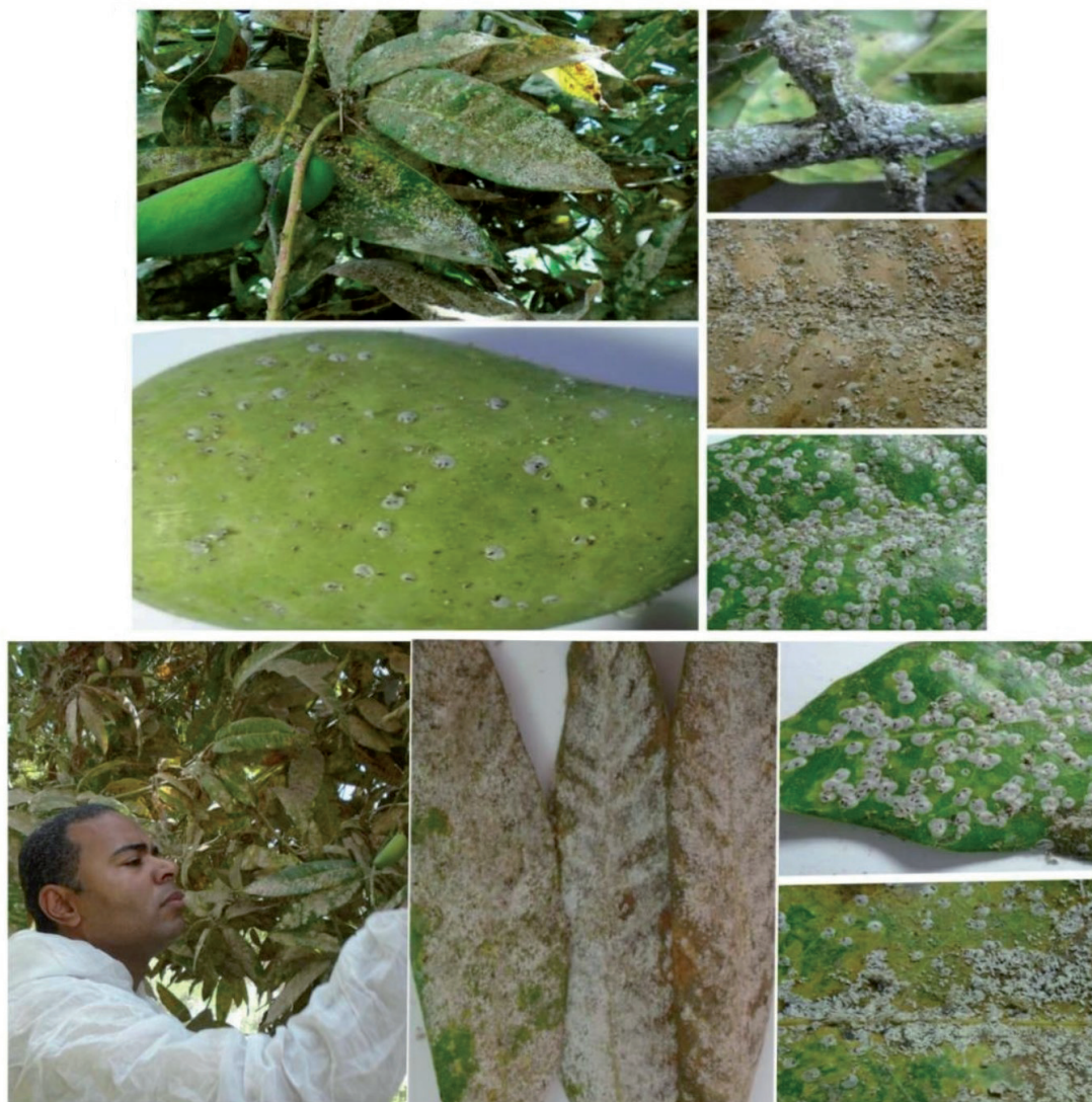
Fig. 1. The visual symptoms of A. tubercularis infestation on the leaves, stems, and fruits of mango trees (Source: Samples collected from the infested mango farm by Dr. Moustafa M.S. Bakry, July 2022).