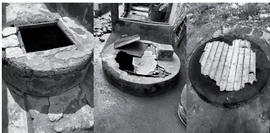
Fig. 2a). Poorly maintained hand-dug wells within the communities.

the Agilent 710-axial inductively coupled plasma-optical emission spectrometry (ICP-OES). The mean values of the analyses were adopted for this report. The Agilent 710-axial ICP-OES, which has a limit of detection (LoD) and a limit of quantitation (LoQ) of 0.096 mg/l and 0.292 mg/l, respectively, for cadmium, is a USEPA-approved trace-level elemental analysis technique that uses the emission spectra of a sample to identify