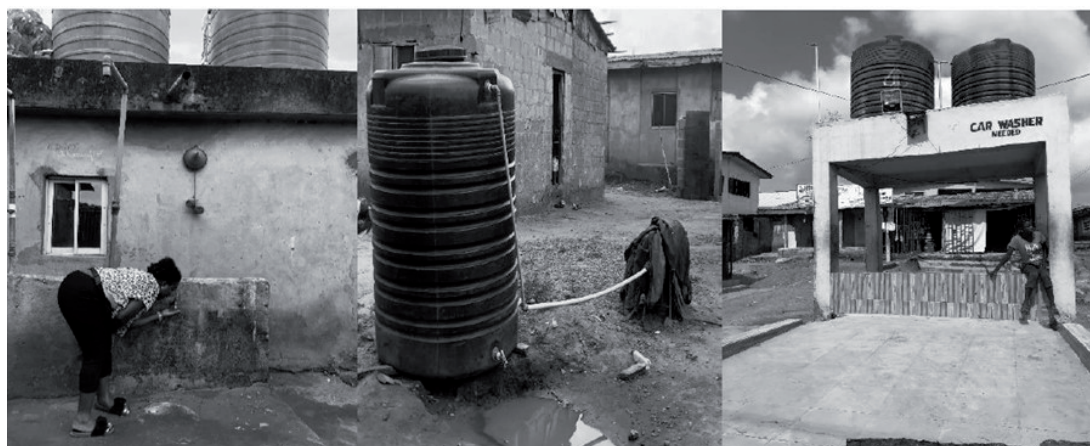
Fig. 2b). Borehole water storage and point of supply within the communities.

and quantify elements present in the sample through a process that desolvates, ionizes, and stimulates them. Standard calibration solutions of cadmium were prepared for the ICP-OES calibration curves. The solutions were prepared from stock standard reference solutions of the individual metals and metalloids by appropriate dilution with deionized water in a volumetric flask. Cadmium was determined in the prepared sample solutions using ICP-OES. An Agilent SPS-3 Autosampler delivered the sample solutions to the ICP. A 3-second rinse was used to assist with the washout of high concentrations of the elements. The reagent blank was determined against a 5-point calibration curve plotted for the standard metal solutions. Quantitation of the analytes was obtained with Agilent Expert II software, and the test results were validated with calibration curves obtained with certified metal standards.