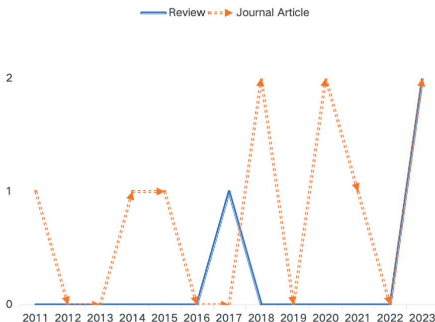
Fig. 2. Review and Journal Article Type and Annual Questions.