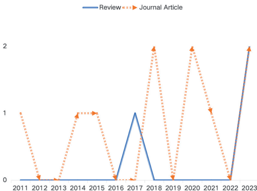
Fig. 2. Review and Journal Article Type and Annual Questions.