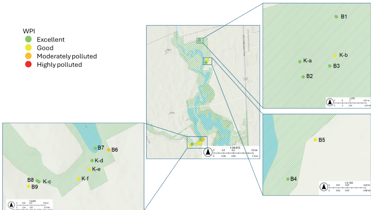
Fig. 2. WPI mean for all samples.

Note: *Sample collected only in April 2019