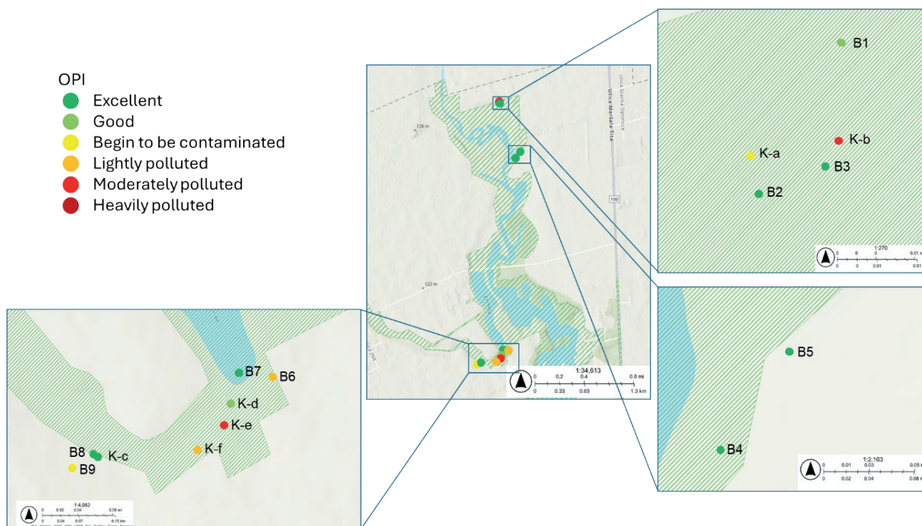
Fig. 4. OPI mean for all samples.

protected area, where B9 was classified as ‘begin to be contaminated’, corresponding to WAWQI and B6 being lightly polluted (Fig. 4). For location B6, moderate