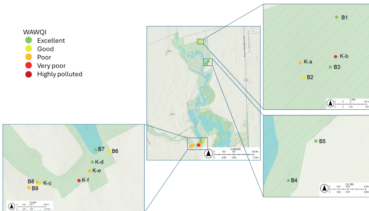
Fig. 3. WAWQI mean for all samples.