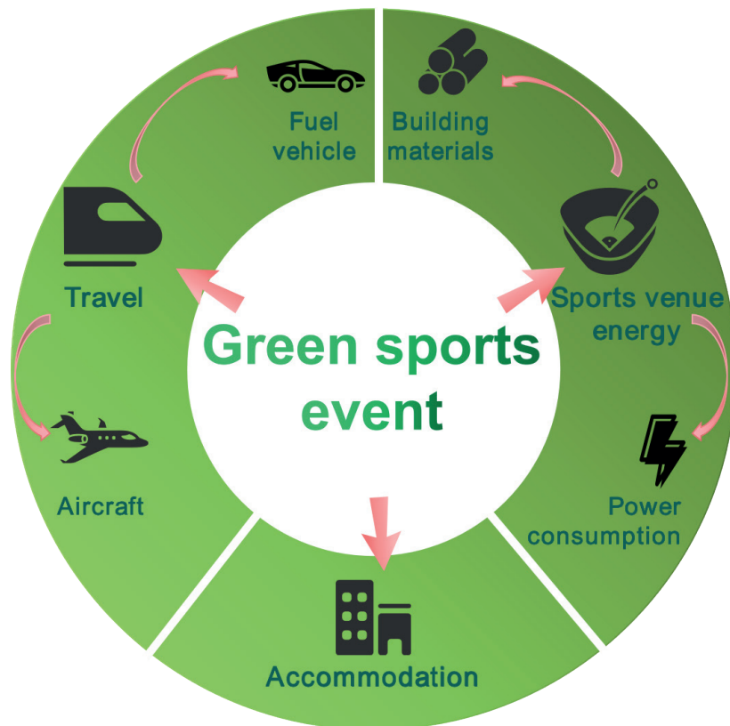
Fig 2. Map of sources of carbon emissions from sporting events (based on the results of this study).

One of the main sources of carbon footprint is the selection of team and fan transport: airplanes and cars.