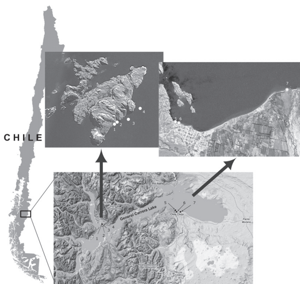
Fig. 1. Satellite image of General Carrera Lake with sampled sites.

The correlation analysis (Pearson correlation test) revealed direct significant correlations between B1 with B2 ( R^2 = 0.871 , p < 0.01 ), B1 with B3 ( R^2 = 0.758 , p < 0.01 ), B1 with B4 ( R^2 = 0.822 , p < 0.01 ), B1 with B5 ( R^2 = 0.935 , p < 0.01 ), B1 with B7 ( R^2 = 0.624 , p < 0.05 ), and B1 with total dissolved solids ( R^2 = 0.524 , p < 0.05 ); B2 with B3 ( R^2 = 0.977 , p < 0.01 ), B2 with B4 ( R^2 = 0.993 , p < 0.01 ), B2 with B5 ( R^2 = 0.935 , p < 0.01 ), and B2 with total dissolved solids ( R^2 = 0.807 , p < 0.01 ); B3 with B4 ( R^2 = 0.994 , p < 0.01 ), B3 with B5 ( R^2 = 0.857 , p < 0.01 ), and B3 with total dissolved solids ( R^2 = 0.888 , p < 0.01 ); B4 with B5 ( R^2 = 0.905 , p < 0.01 ) and B4 with total dissolved solids ( R^2 = 0.849 , p < 0.01 ); B5 with B7 ( R^2 = 0.612 , p < 0.05 ) and B5 with total dissolved solids ( R^2 = 0.554 , p < 0.05 ); and calanoid copepodites with temperature ( R^2 = 0.540 , p < 0.05 ) and calanoid copepodites with conductivity ( R^2 = 0.565 , p < 0.05 ) (Table 2). Whereas we found inverse significant correlations between B1 with calanoid copepodites