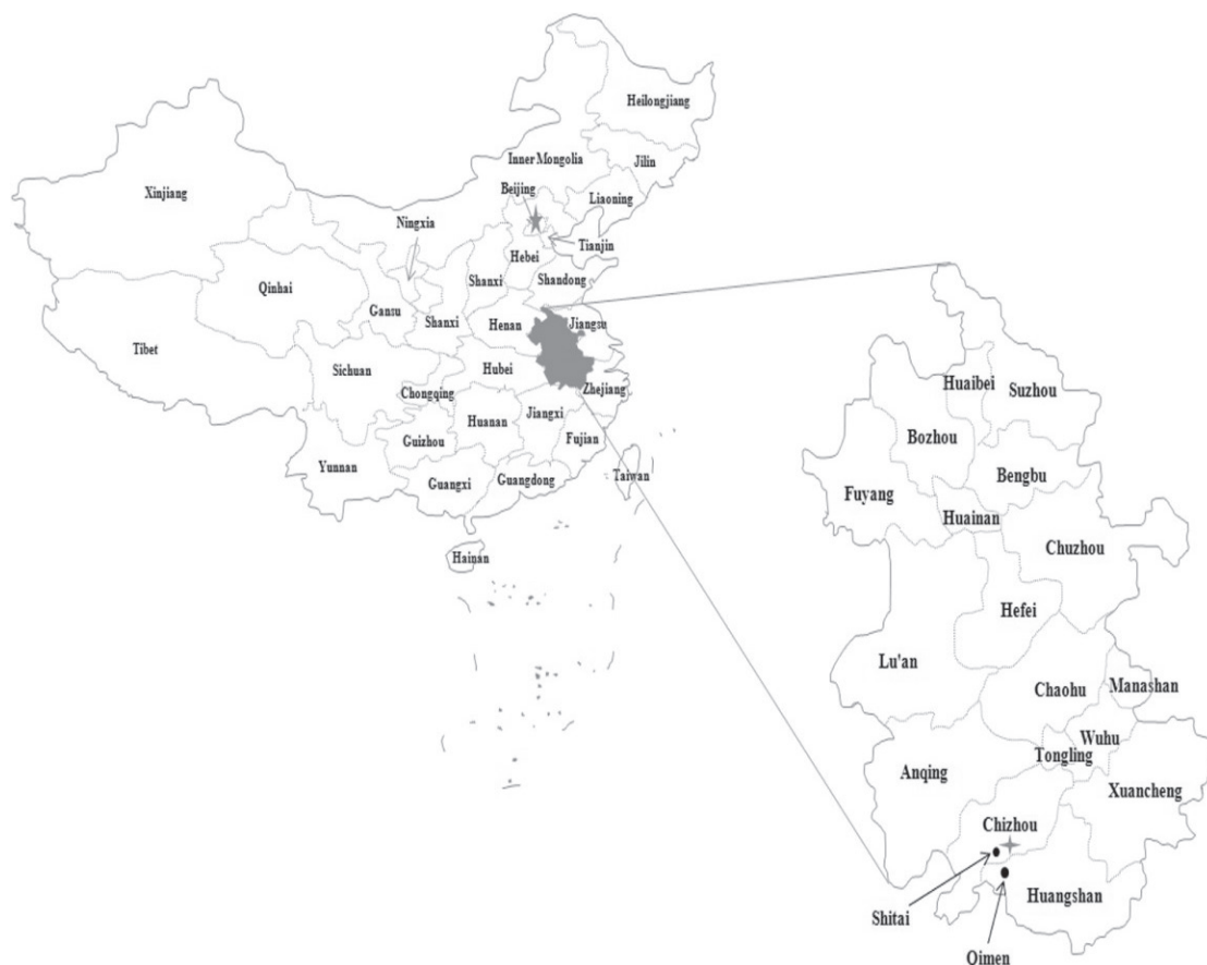
Fig. 1. Study site in Chizhou, Anhui Province.

Eighty-three crop samples and 144 Chinese herb samples were collected in a mountainous area of Anhui Province, China. All the soils from the roots of the plants were collected simultaneously. The sampling region is located at the intersection of Shitai and Qimen counties (Fig. 1). It contains Dashan, Shili, Shuangkeng,