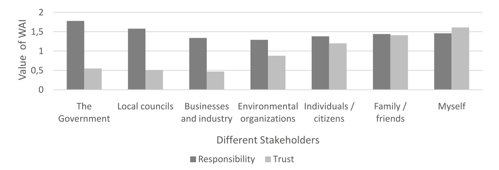
Fig. 1. Level of Responsibility and Trust on different stakeholders in society.

Results in Fig. 1 indicated government, local councils and business and industry as highly responsible for making any changes to lessen the impacts of climate change. While studying level of trust, highly responsible stakeholders were indicated as not trusted by most of the respondents. An interesting finding about environmental organizations was observed, although they were considered less responsible but they were trusted. This may be due to the recent active role of environmental organizations in responding to negative impacts of climate change.