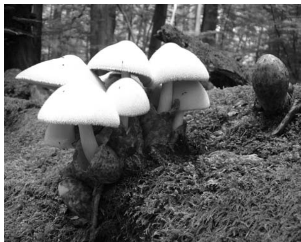
Fig. 1. Group of basidiomata of Volvariella bombycina (Schaeff.) Singer on an old beech log in the strictly protected Radęcin area in Drawa National Park (13 Aug 2010).

In Poland, Volvariella bombycina occurs in more than 80 locations, including 12 new ones found by the authors in recent years. It is found on 25 species of broadleaved trees of 16 genera (Tables 1 and 2).