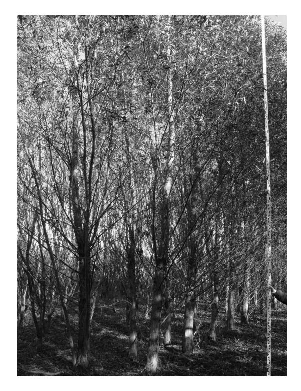
Fig. 3. Seven-year-old willows cultivated at a density of 5,200 plants ha<sup>-1</sup> in the Eko-Salix system.

Twin row planting was applied in the first variant (I - 5,200 \text{ ha}^{-1}) with a space of 0.75 m between two rows in a stripe, and subsequently a space of 1.8 m and another two rows with a space of 0.75 m between them (Fig. 3). There were two rows in each plot