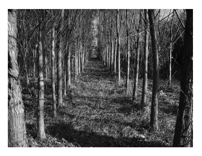
Fig. 4. Seven-year-old willows cultivated at a density of 7,400 plants ha^{-1} in the Eko-Salix system.

(38.3 m<sup>2</sup>), and there was a space of 1.5 m between rods in a row. Inter-row spaces of 1.8 m were applied in the second variant (II – 7,400 ha<sup>-1</sup>) (Fig. 4). There were two rows in each plot (54 m<sup>2</sup>), and there was a space of 0.75 m between rods in a row. Rods (2.4 m long) were obtained from three-year willow shoots; they were rootless and they were planted with a water drill at a depth of 0.4 m and soil was pressed thoroughly to the seedling.