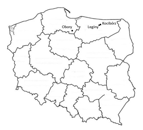
Fig. 1. Location of field experiments.

which are of little use or unusable for growing food crops (periodically flooded or difficult in cultivation), periodically excluded from use and some fallow lands. In order to restore the land for use, the authors made an innovative – relative to the commonly used (SRC) [3, 12-15] – attempt to grow willow in the Eko-Salix system [11, 16]. The new concept of growing willow eliminates ploughing, makes use of long rods, limits fertilisation and care procedures and plants are harvested in a long, more than 5-year rotation.